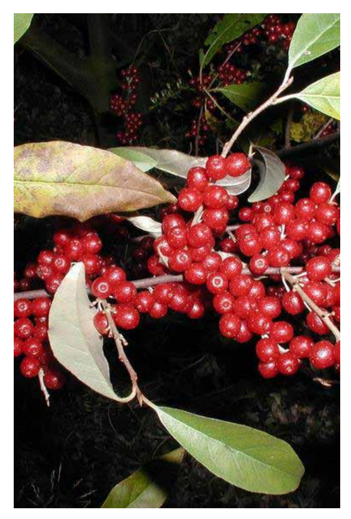
Viable plant parts, such as fruit and seeds, should not be backyard composted.

Call ahead to your local municipality about disposal availability for invasive plant material. If your local municipality accepts invasive plant material in the local landfill, carefully place reproductive plant material in black plastic garbage bags. Seal the bags tightly and leave in direct sunlight for one to three weeks, to kill any living plant material. Check the bags to make sure the plant material has died and deposit in the landfill.