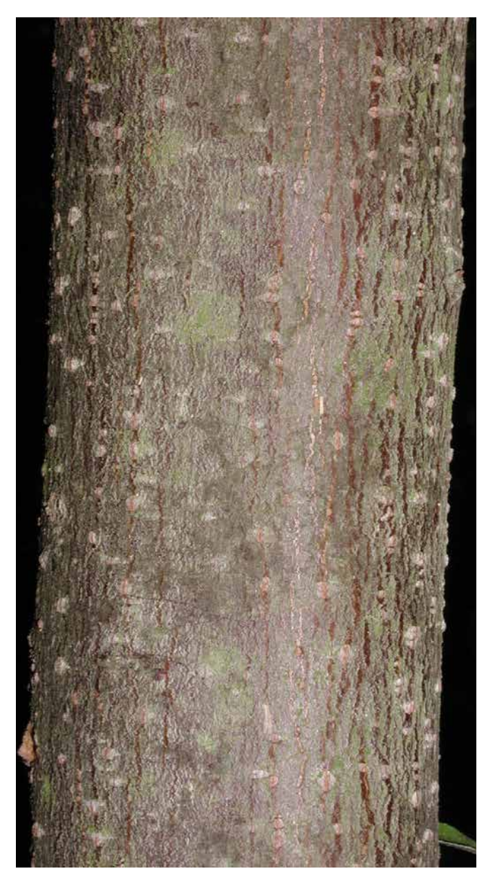
Mature stems are light gray to gray-brown in colour.

Young twigs are silvery with orange or brownish scales, giving them a speckled appearance. As the plant ages the bark becomes light gray to graybrown and fibrous. Each shrub is typically multistemmed, containing long (2.5 to 5 cm) thorns on spur branches.