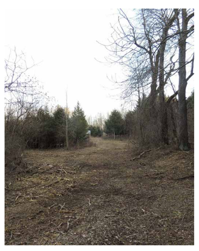
(AFTER) Autumn olive and multiflora rose thicket after mulching.