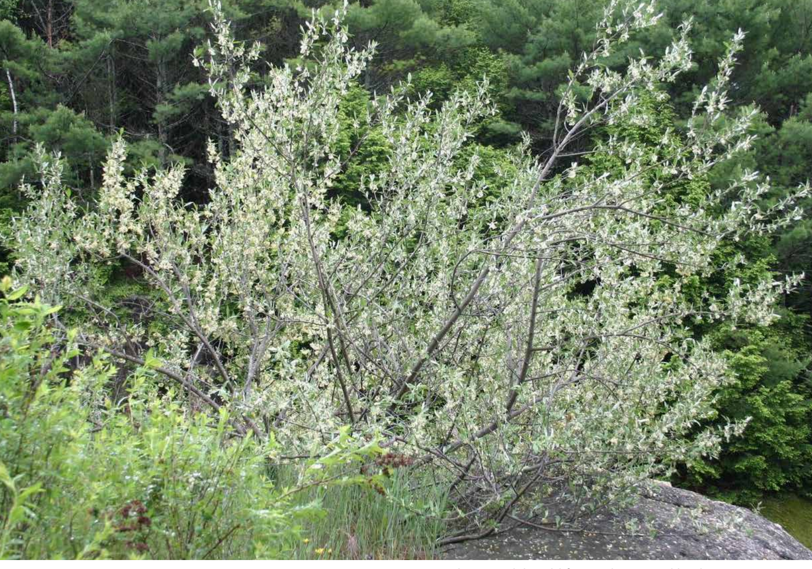
Autumn olive is widely sold for gardening and landscaping.