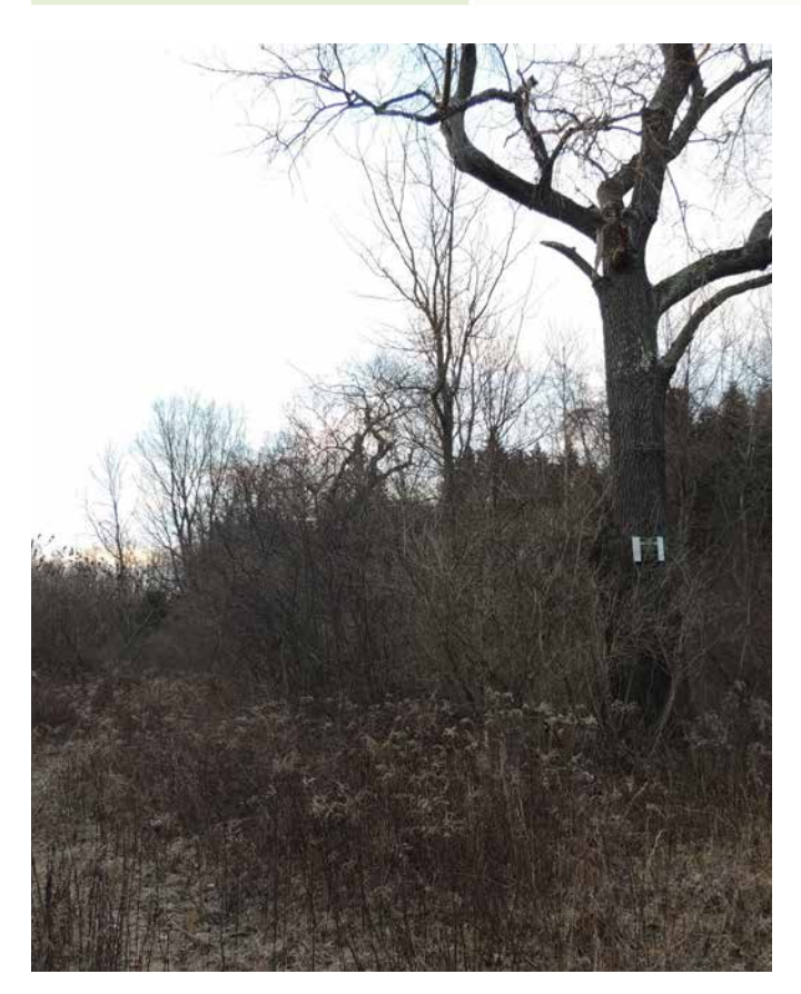
(BEFORE) Autumn olive and multiflora rose thicket before using mulching as a control method.