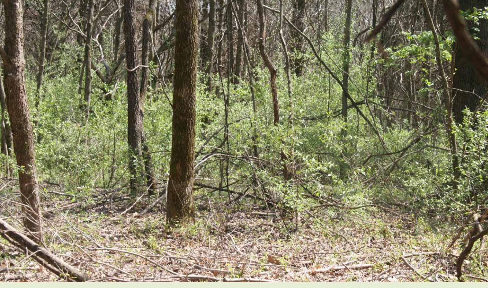
Autumn olive outcompetes native plants for light, space and nutrients.