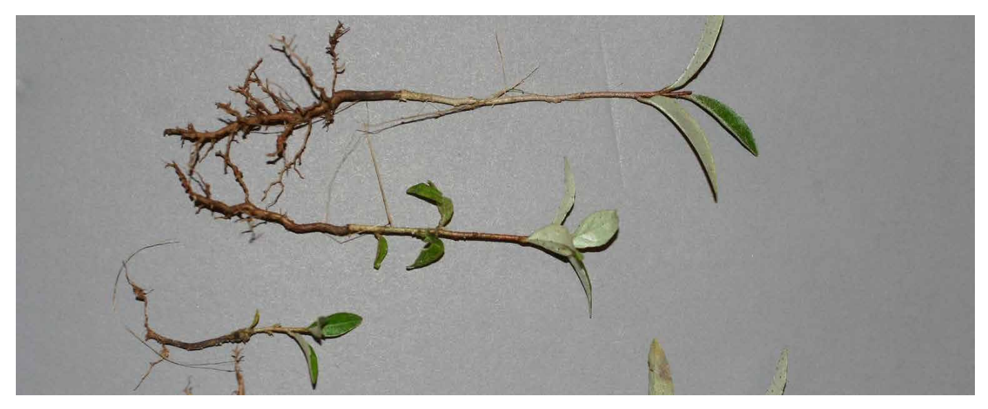
Seedlings and very young plants can be hand-pulled but the entire root must be removed to prevent re-sprouting.