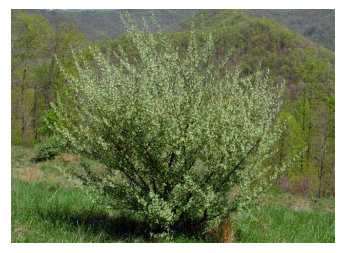
Autumn olive can grow up to 6 m tall and 9 m wide.

Autumn olive is a medium to large shrub growing up to 6 m tall and 9 m wide. Its crown is rounded with dense branches.