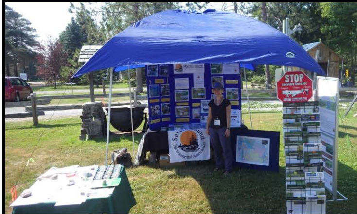
Canadian Heritage Day