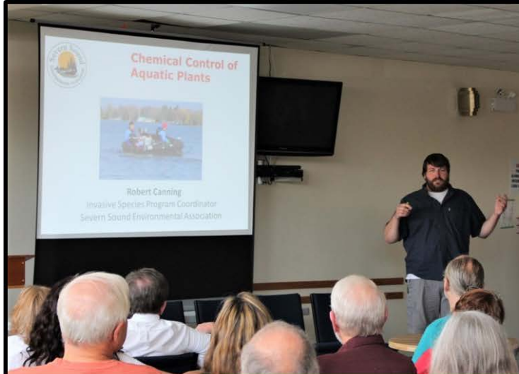
Farlain Lake Community Association AGM