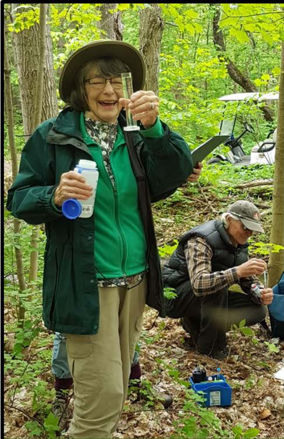
Copeland Forest Friends