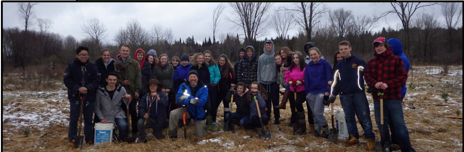
Cold weather tree planting!