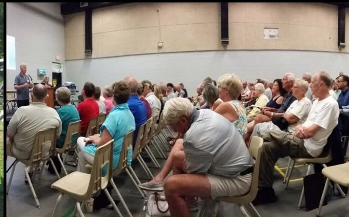
Weed and Algae Seminar