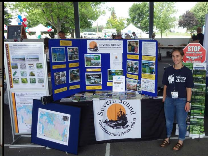
Tiny Community BBQ