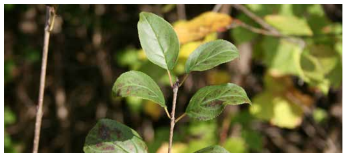
Common Buckthorn leaves are opposite to sub-opposite.