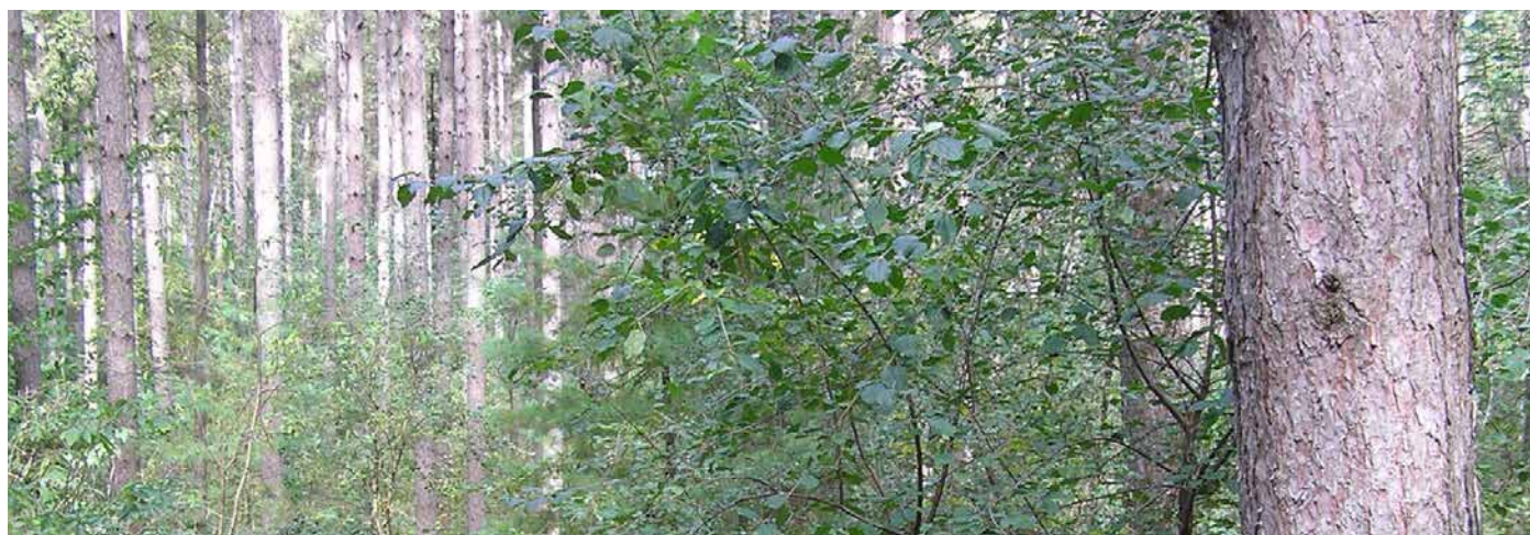
Common Buckthorn invading a pine plantation.

In southern Ontario, Common Buckthorn is found along forest edges and as a dominant part of the forest understory. It aggressively invades hardwood (deciduous) and softwood (coniferous) forests and can harm the surrounding soil similarly to aggressive allelopathic 1 invaders, such as Garlic Mustard ( Alliaria petiolata ). In North America, Common Buckthorn develops its leaves weeks before native species and loses them weeks after, effectively outcompeting native species for sunlight. These traits make it particularly harmful to hardwood forests and make it hard for land managers to promote healthy forest growth and succession.