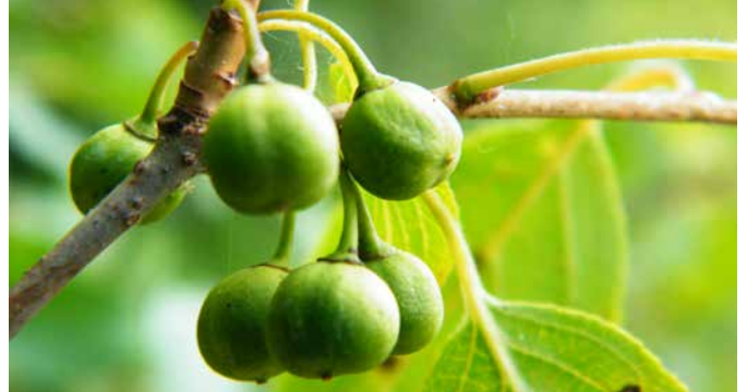
Immature Common Buckthorn fruit.

In late July and August, black fruits are produced on the female trees, and are found in dense clusters in the leaf axils (where the leaf attaches to the stem). Each fruit contains 3-4 seeds and has deep narrow grooves on the back. The fruits remain on the plant well into the winter.