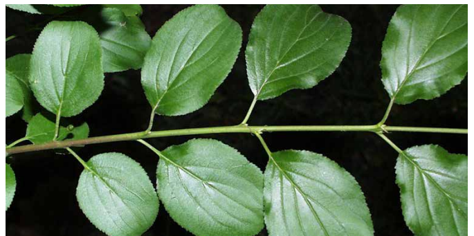
Opposite to sub-opposite leaves.