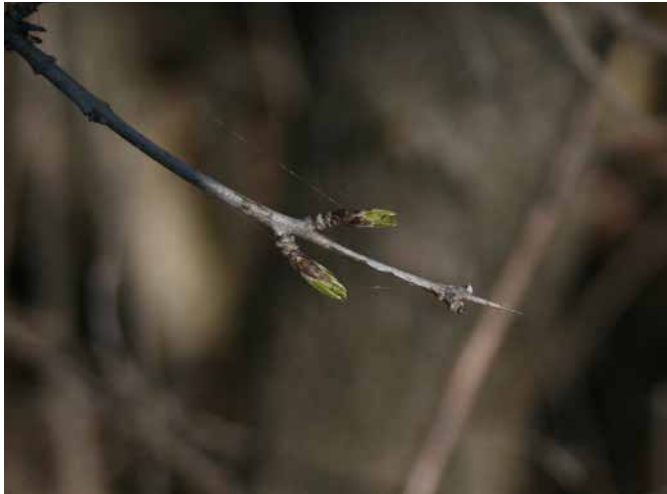
Common Buckthorn has a thorn-like tip.

On many twigs there are small thorn-like tips, which are generally located at the end of the twig. The buds are pointed and hug the stem.