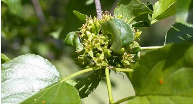
Common Buckthorn has greenish-yellow inconspicuous flowers.

Common Buckthorn has inconspicuous four-petal flowers that are greenish-yellow, 6 mm across, and appear in early June on short threadlike stalks.