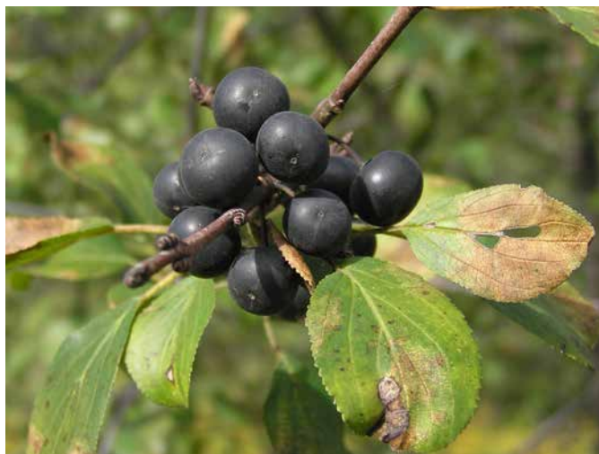
Common Buckthorn berries.

Common Buckthorn is dioecious, meaning individual trees have either male flowers or female flowers, but not both. Only female trees produce seed. Common Buckthorn will flower prolifically in the early spring, often unnoticed because of the small flower size. It sets seed rapidly and in great quantity from late July to August and berries persist into the winter. Fallen seeds can produce a seedling in as little as 28 days. Seeds may also be dropped in the water and carried downstream.