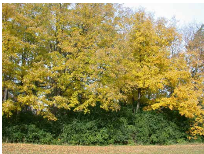
Common Buckthorn in the fall, still green while other species have changed colour.

Common Buckthorn is a shade-tolerant plant that forms dense thickets. It is one of the first trees to leaf in early spring, getting a head start on growing when other shrubs and trees are leafless. It also retains its green leaves well into the fall (November in some areas) when nearly all other accompanying species are leafless or have changed colour. Its dense thickets suppress shade-intolerant species – the end result being a Common Buckthorn monoculture.