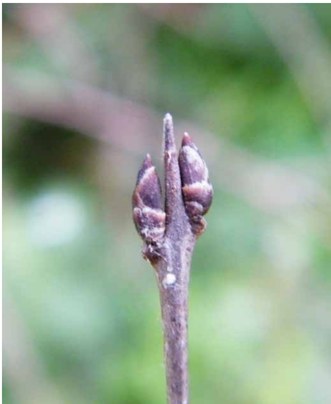
The buds of Common Buckthorn are pointed and hug the stem.