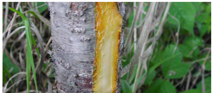
The cambium layer (directly under the bark) of Common Buckthorn is orange.