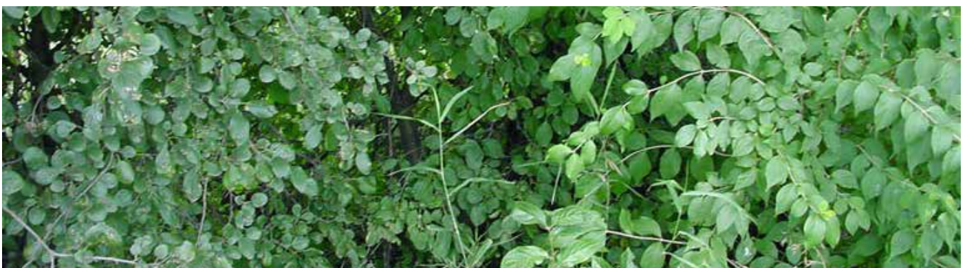
Site invaded by Common Buckthorn and exotic honeysuckle. Buckthorn on left, honeysuckle on right.

The berries are eaten by thrushes (Turdidae), waxwings (Bombycilla), White-throated Sparrows ( Zonotrichia albicollis ), European Starlings ( Sturnus vulgaris ), jays (Corvidae) and small mammals. The laxative properties of the seeds ensure they are spread widely and rapidly. Seedlings will begin to sprout under perch trees, and along fence lines and woodland edges. The seeds are also long-lived five years and will rapidly colonize a site if space becomes available. Under conditions of full sun, favourable soil conditions (especially disturbed soils) and no competition, Common Buckthorn can mature and produce seed in a few years.