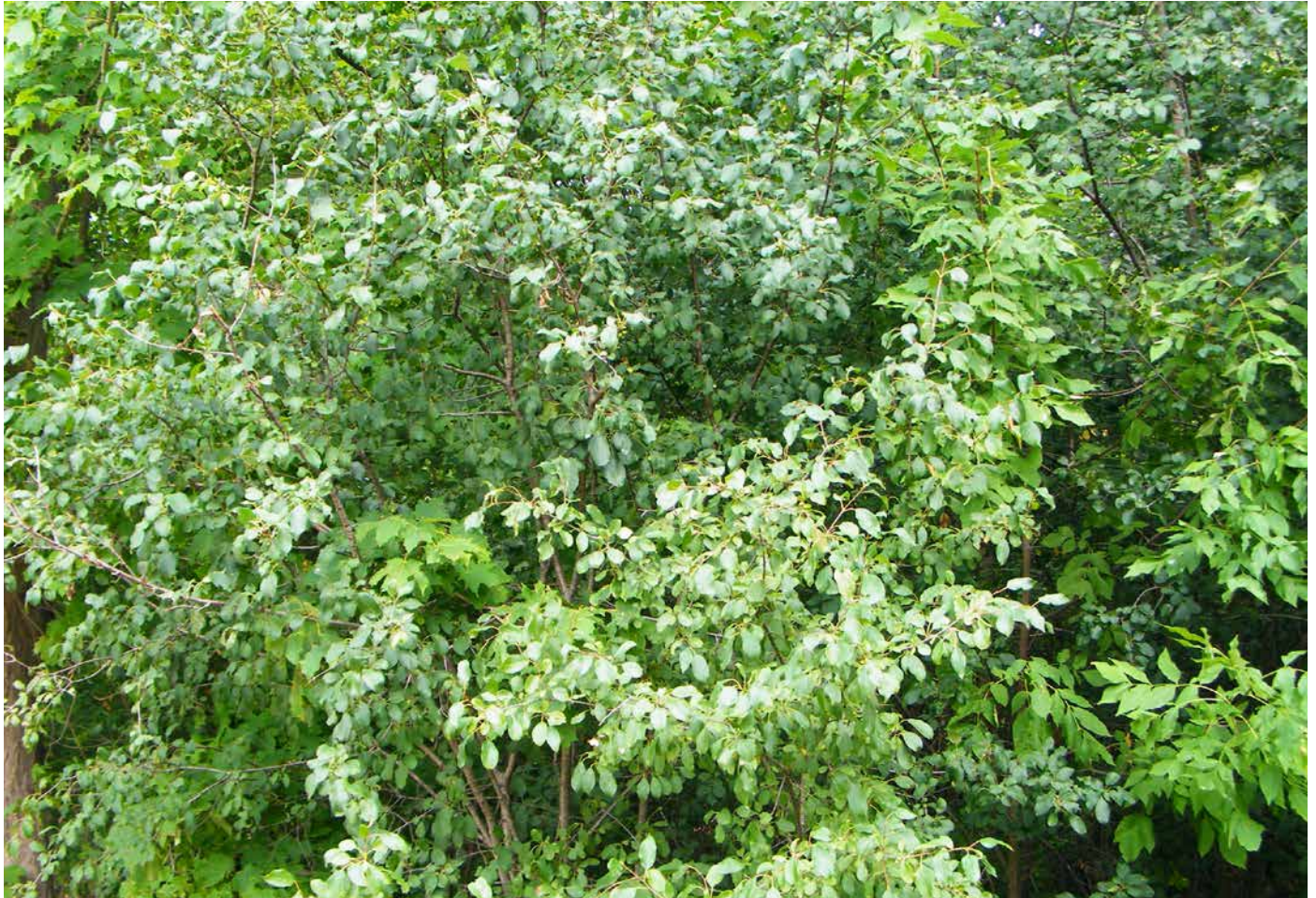
Common Buckthorn in a natural area.

Common Buckthorn can inhibit recreational activities in areas where it has become established. Its dense stands can make it difficult to walk along established trails. Common Buckthorn also harms the aesthetic value of natural areas by reducing the abundance and variety of native species such as wildflowers.