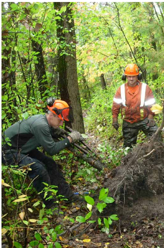
Removing a cut stump

Since 2001, research has been on-going to identify potential bio-control agents using a predator, disease or other natural control to fight Common buckthorn. Over the past 10 years, nine species have been studied and discarded because they may have impacts on other non-target species (lack of host-specificity). Testing for Common Buckthorn is ongoing using two psyllids (sap-sucking lice) and a seed-feeding midge that have shown host-specificity in early trials. Research in to the relationship between soil organisms and pathogens and Common Buckthorn will also be conducted in the future.