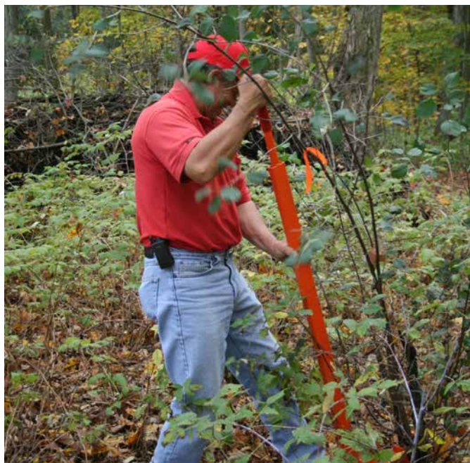
Removal using a weed wrench tool.

Removal using a weed wrench tool can be effective for stems up to 5cm in diameter. For larger trees (greater than 5cm in diameter) some organizations have reported success using a tractor to pull plants, however this leaves a large hole which will need to be re-planted. If not re-planting immediately, an annual cover crop can be used until planting takes place.