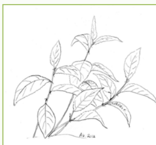
Alder Leaved Buckthorn