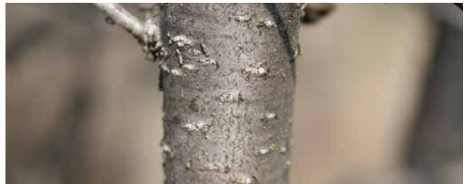
Lenticels on the bark of a young Common Buckthorn.

The stems of Common Buckthorn are very dark grey to black with prominent small lenticels (lines), similar to birch. The bark is smooth and shiny with a metallic sheen when young, and rough textured when mature. When the bark is scratched or removed, the under layers are yellow-green and the cambium layer (directly under the bark) is orange.