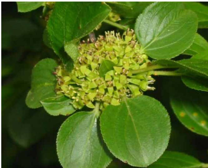
Flowers are borne on short stalks.