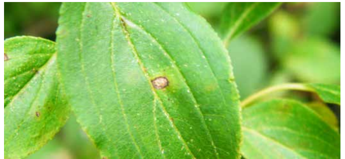
Common Buckthorn leaves have prominent, curved veins.

Leaves are opposite to sub-opposite, and occasionally alternate. They have sharp tips, and are pointed, curved or folded. The margins are somewhat finely toothed with rounded tips on the teeth. There are 3-5 strongly curved prominent veins per side which arch towards the tip of the leaf.