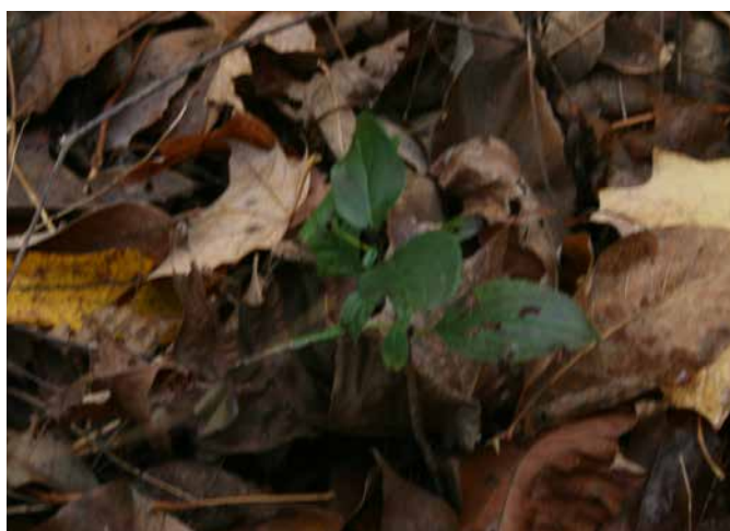
Common Buckthorn seedling.

Common Buckthorn berries are often one of the only berries that last into the winter. The seeds are spread after being eaten by birds and mammals. They move through the animal's digestive system quickly, and the animal then excretes the seeds away from the parent shrub, further enabling its widespread invasion. These seeds can remain in the soil for up to 5 years resulting in a need for long term management.