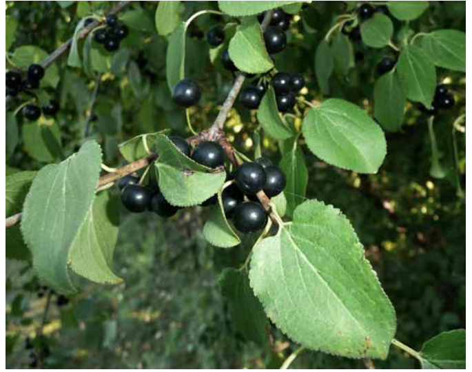
Common Buckthorn has black fruits in dense clusters.