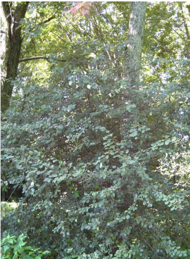
Common Buckthorn often grows as a mid-size (height) tree.

Common Buckthorn is a woody plant that ranges in size from a shrub to small tree; reaching heights of 6 - 7 m. Old and large tree specimens can have trunks up to 25 cm in diameter.