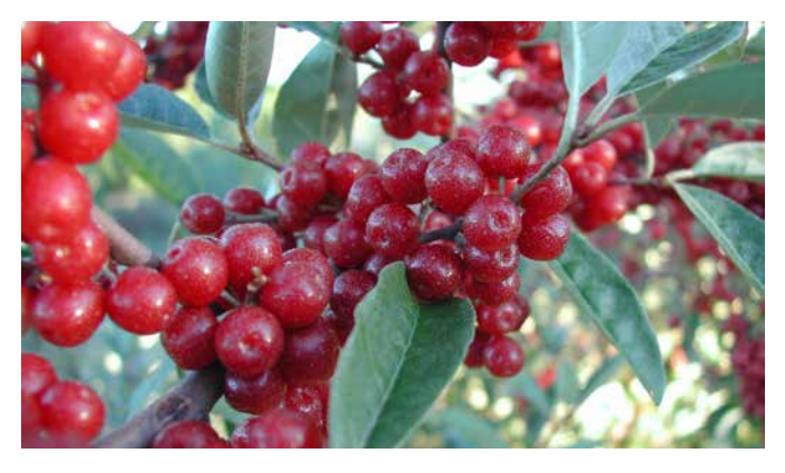
The fleshy, berry-like fruit is a rich pink or red with silver flecks when ripe.

The small (3 to 9 mm long), rounded, single-seeded, juicy drupes grow on short stalks (pedicels). They appear silvery with brown scales when young, ripening to a rich pink or red speckled colour. Ripening takes place in September through October.