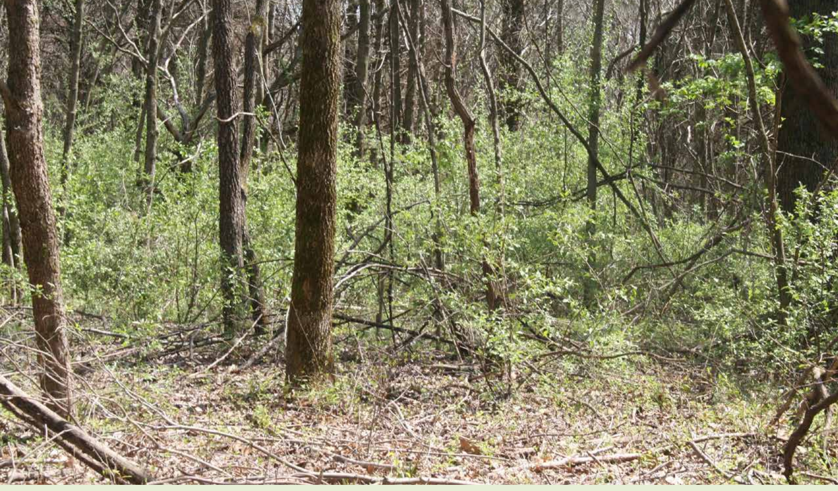
Autumn olive outcompetes native plants for light, space and nutrients.