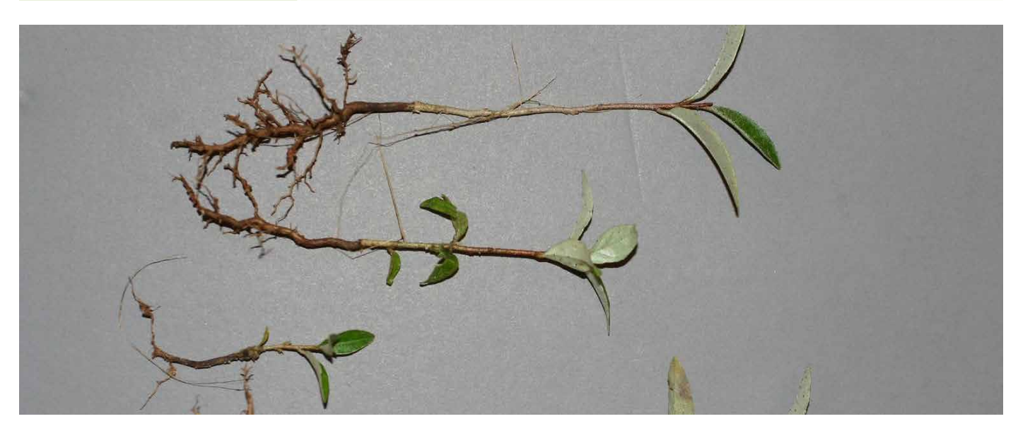
Seedlings and very young plants can be hand-pulled but the entire root must be removed to prevent re-sprouting.