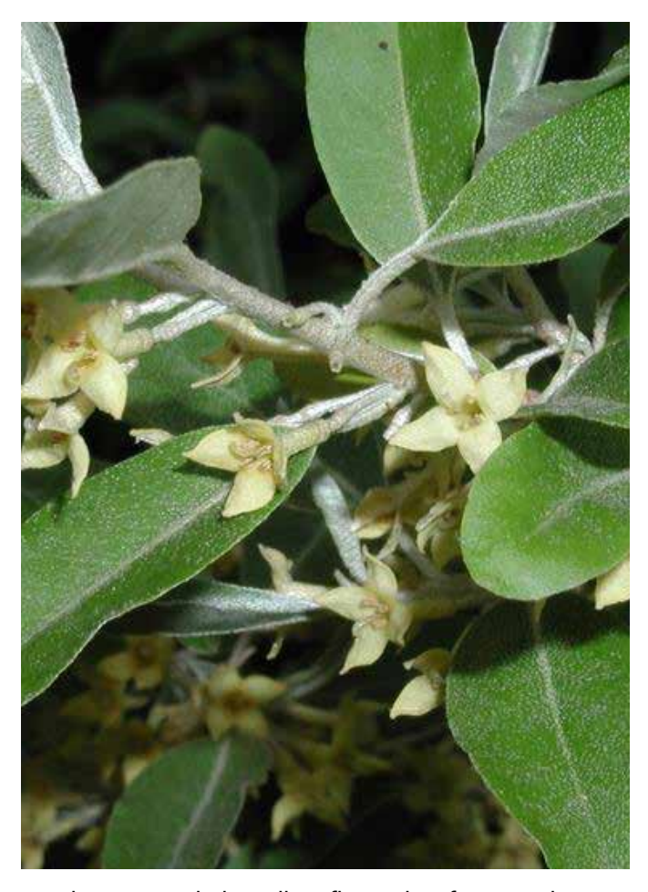
Each cream to light-yellow flower has four petals. The flowers are arranged in clusters situated in the leaf axils.

Autumn olive has fragrant cream or light-yellow tubular flowers, each typically 4 to 10 mm long and 7 mm in diameter. Each flower has four petals and four stamens. The flowers are arranged in clusters of 1 to 10 in the leaf axils. They bloom from May to June and are pollinated by insects.