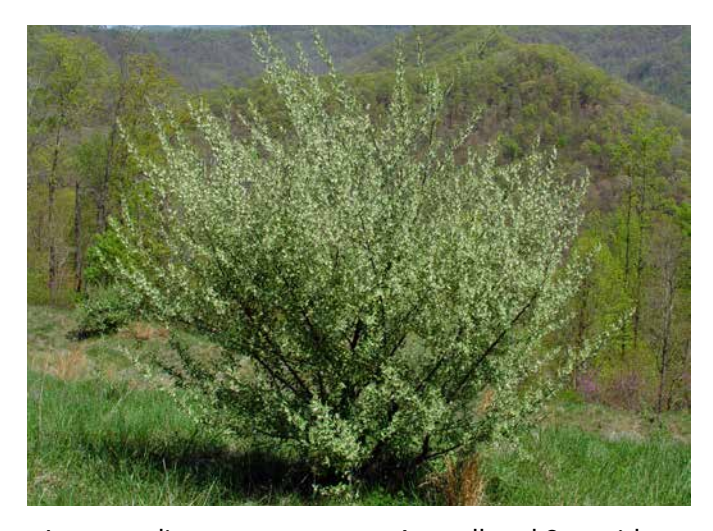
Autumn olive can grow up to 6 m tall and 9 m wide.

Autumn olive is a medium to large shrub growing up to 6 m tall and 9 m wide. Its crown is rounded with dense branches.