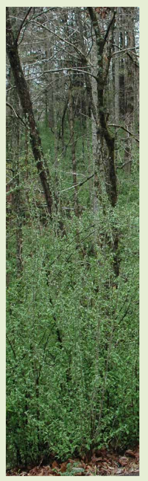
Autumn olive.