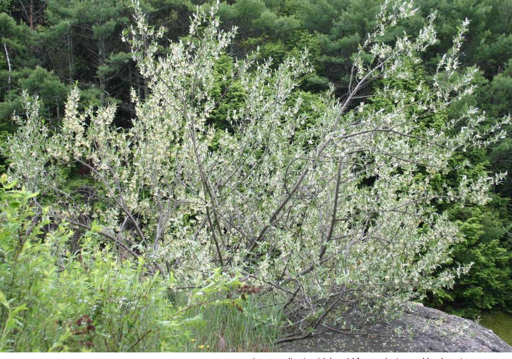
Autumn olive is widely sold for gardening and landscaping.