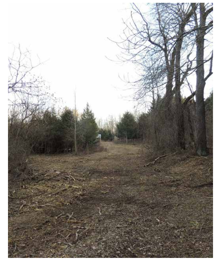
(AFTER) Autumn olive and multiflora rose thicket after mulching.