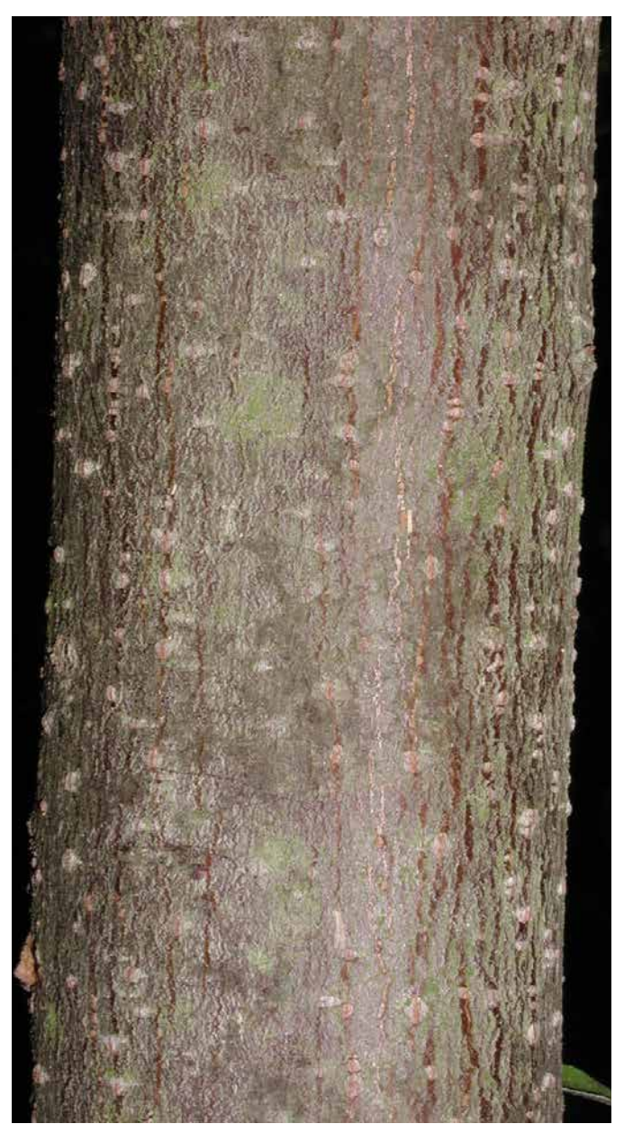
Mature stems are light gray to gray-brown in colour.

Young twigs are silvery with orange or brownish scales, giving them a speckled appearance. As the plant ages the bark becomes light gray to gray-brown and fibrous. Each shrub is typically multistemmed, containing long (2.5 to 5 cm) thorns on spur branches.