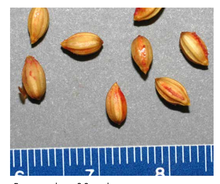
Brown seeds are 3-9 mm long.

Its seeds are yellow and approximately 3 to 9 mm long.