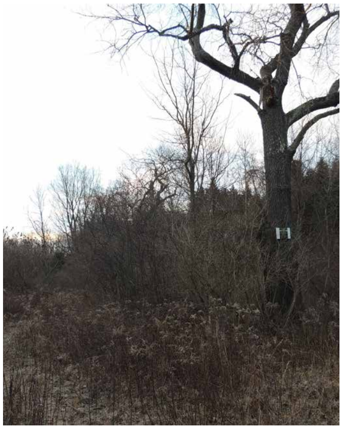
(BEFORE) Autumn olive and multiflora rose thicket before using mulching as a control method.